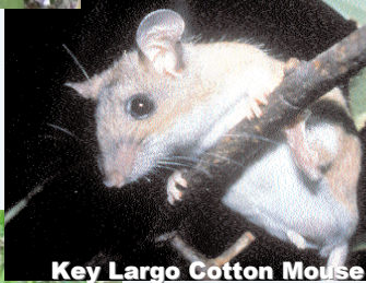
Key Largo Cotton Mouse