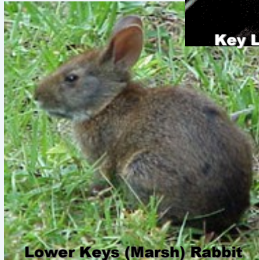
Lower Keys (Marsh) Rabbit