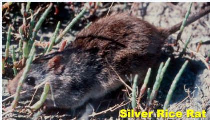
Silver Rice Rat