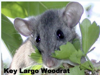
Key Largo Woodrat